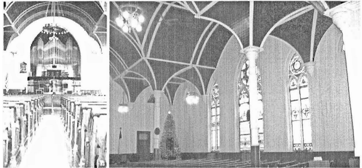
The Sanctuary—Walden United Methodist Church

The November 11 th concert will focus on literacy in our region. A portion of the proceeds will go to The Literacy Volunteers of Orange County, Inc.